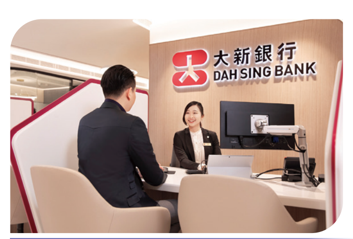
我們致力提供個人化及貼心的客戶服務 We are dedicated to providing personalised and attentive customer services

In 2021, we worked with an external consultancy firm to conduct our Customer Satisfaction Survey to understand our customers' experiences with and perception towards the Group. During the exercise, we refined our methodology in using Net Promoter Score ("NPS") to measure customer satisfaction and conducted online surveys and phone interviews to cover retail, corporate and private banking customers. Our customers acknowledged our performance in establishing trust and in providing personalised and attentive customer services. Going forward, we are aiming to make the Customer Satisfaction Survey an annual exercise to gauge customer feedback and to improve our services.