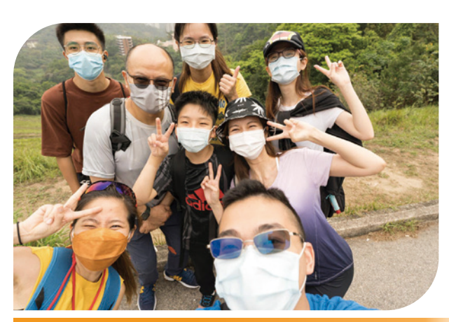
大新保險員工作為「結伴再成長—兒童發展基金計劃」的導師,與參加者出席不同活動 Acting as mentors for "Growing Partners II – Child Development Fund Project", DSI staff participated various activities with mentees

Meanwhile, DSI has continued to support "Growing Partners II – Child Development Fund Project" since 2020. The three-year programme, organised by The Boys' and Girls' Clubs Association of Hong Kong, cultivates positive personal attributes in teenagers aged between 10 to 16 from underprivileged families. DSI staff act as mentors and continue to build relationships with the mentees via various activities and workshops.