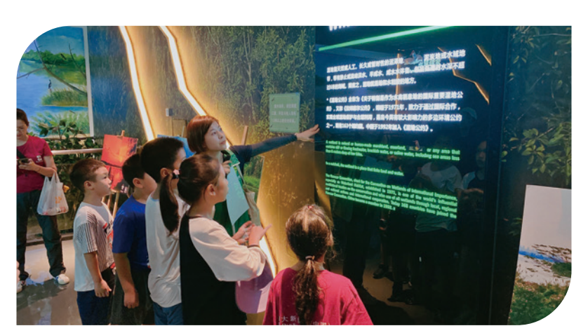
大新銀行(中國)在華僑城濕地公園舉辦培訓課程,以提升僱員環保意識 DSB China held a training course at Huaqiao City Wetland Park to increase employees' awareness of environmental conservation

DSB China also organised employee outings to increase awareness of environmental conservation. For example, it held a training course in November 2021 at Huaqiao City Wetland Park to educate employees on how to maintain ecological balance, protect wetlands and the environment.