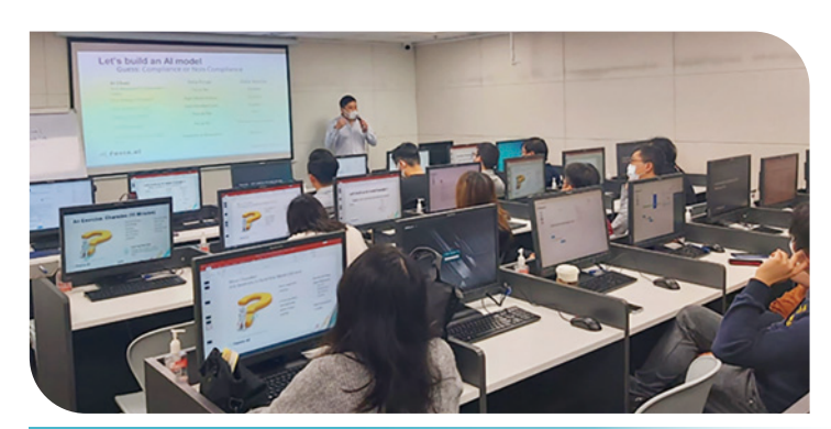
數碼化101系列-金融服務業人工智能實踐培訓-自動化 Digitalisation 101 Series – Practical Training of Al in Financial Services – Automation

With digitalisation being one of our development focuses, we launched three additional programmes – "Digital Onboarding", "Competing with Data in the Financial Services Industry" and "Practical Training of Artificial Intelligence (AI) in Finance Services – Automation" – to equip employees with an understanding of the latest trends and developments in technology application in the financial industry. These were attended by a total of 265 participants. To support the Group's strategic focus on GSB and ESG, training needs will be evaluated to identify and arrange relevant training for selected staff.