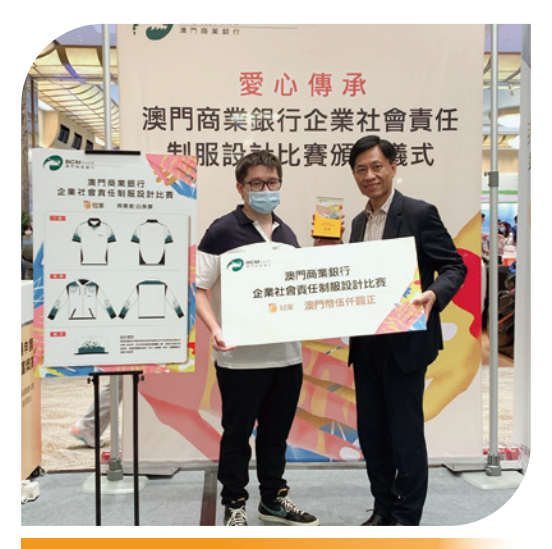
澳門商業銀行企業社會責任制服設計比賽 BCM CSR T-shirt Design Competition

In Macau, BCM supported several youth-focused programmes during the year. In March, a "CSR T-shirt Design Competition" for the young segment was organised to support young designers and students, with the top three winners receiving a total of MOP8,000, and the champion design being used as a blueprint of a new CSR uniform for the bank. In April, an educational talk for 170 students at the Escola Nossa Senhora de Fatima was carried out, focusing on topics including key economic factors in the financial market, sharing of the banking industry and operations. In addition, BCM sponsored scholarships to outstanding students at the University of Macau in August and those from the Macau University of Science & Technology in November 2021.