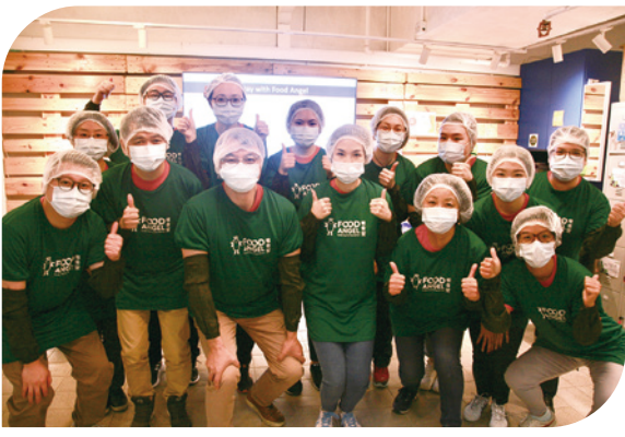
大新保險員工參加與惜食堂合辦之速凍餐盒製作活動 DSI staff participated in a cook-chill meals preparation event co-organised with Food Angel