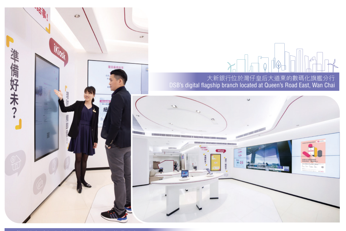
互動區讓客戶在服務大使的協助下使用數碼服務 Interactive zones allow customers to explore digitally enabled services with support from our service ambassadors

We leveraged our data capabilities to offer smooth and empowering experiences to customers in navigating our multiple touchpoints. The introduction of DSB's digital flagship branch features our blend of technology-powered services of providing paperless and efficient workflow, allowing our branch staff to attend to customer needs. Interactive zones allow customers to explore digitally enabled services with support from our service ambassadors. Virtual Assistant for card loss reporting was also introduced covering credit card, ATM card and cash card.