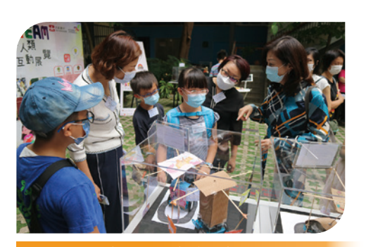
| 智STEAM小人類」計劃互動展覽 "Smart STEAM Kids" Experiential Programme interactive exhibition

In July, the Group's sponsorship in the "Smart STEAM Kids" Experiential Programme concluded after nine months of virtual training against the backdrop of COVID-related challenges in the organisation of school activities. Started in 2020 and launched in collaboration with St. James' Settlement, the programme brought STEAM education to 108 underprivileged primary students across six schools. A total of 90 virtual sessions with 135 training hours were delivered, and culminated in an interactive exhibition of 18 outstanding artworks by the students at the Blue House in Wan Chai and the Fortune Metropolis mall in Hung Hom.